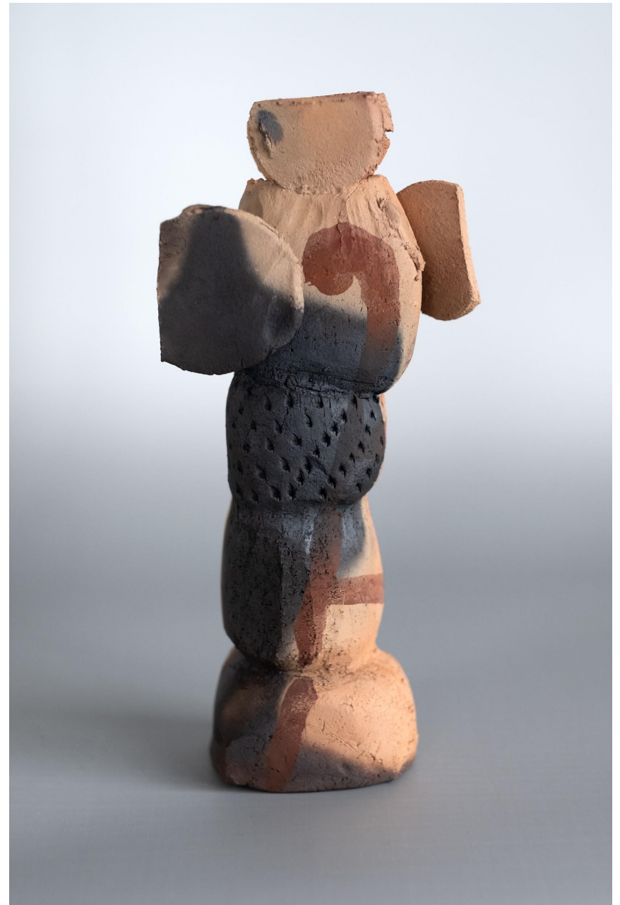
Above: 100 Clay pots. In transit to The Engine Room in association with Massey University, 2019. Left: Meditations on Drawing. Works on paper that assist my painting practice.