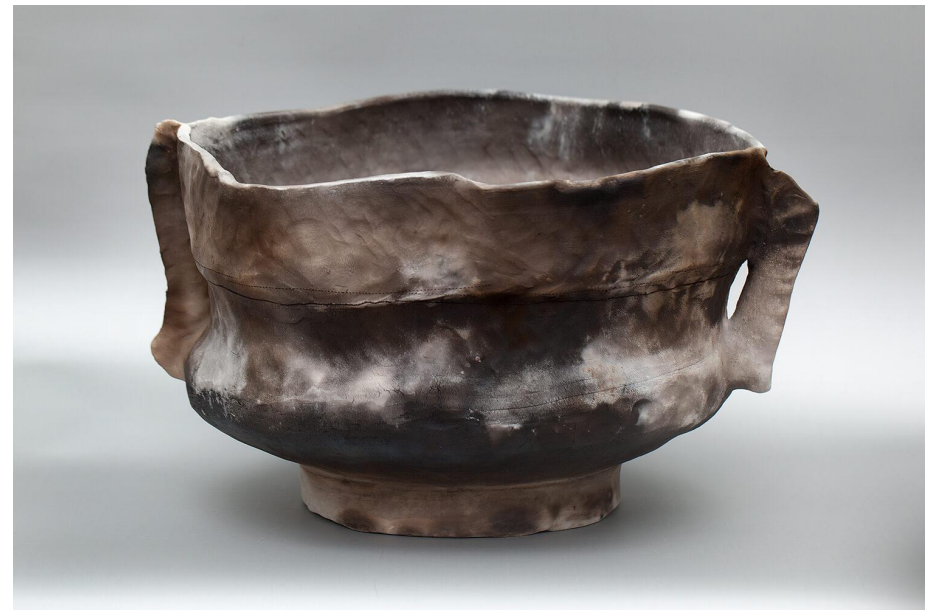
'Hapurānui Whare is Missing' This artwork has an important political narrative. For further details, see here . Made in 2019. Image 1: The artist at the opening of 'Uku Mahi'.