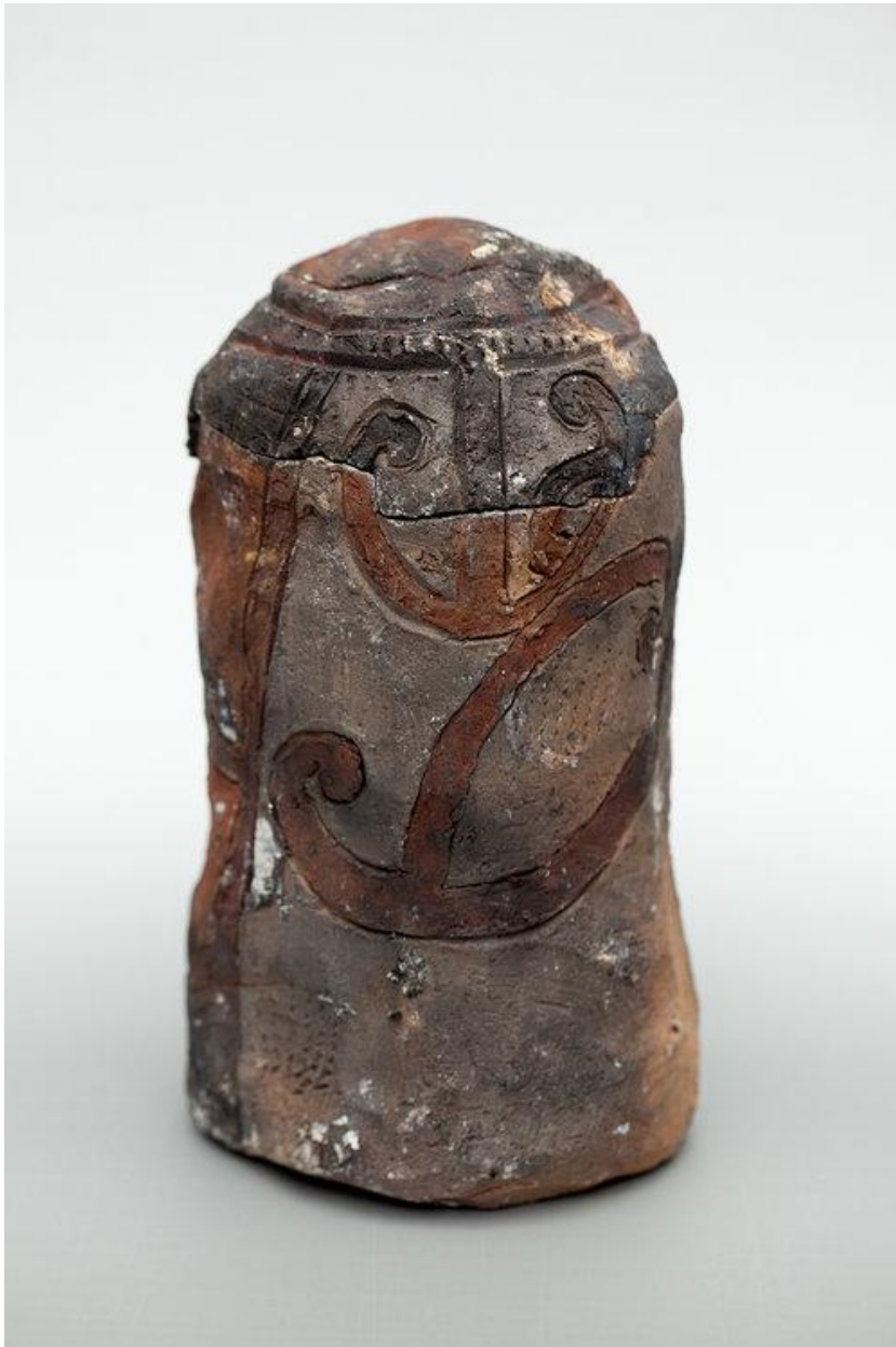
'Ipu Pere' Clay vessel made for 'Uku Mahi - Clay Naughty Clay' 2019.