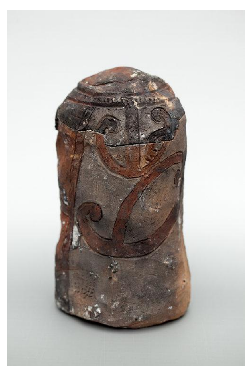
'Ipu Pere' Clay vessel made for 'Uku Mahi - Clay Naughty Clay' 2019.