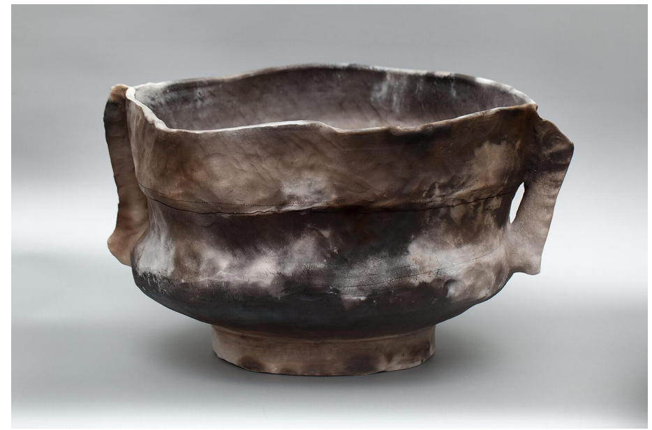
'Hapuranui Whare is Missing' This artwork has an important political narrative. For further details, see <a href="here">here</a>. Made in 2019. Image 1: The artist at the opening of 'Uku Mahi'.